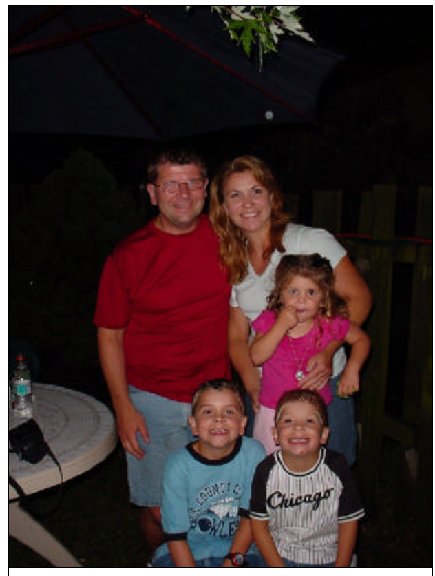
The Staron Family always present in full force!