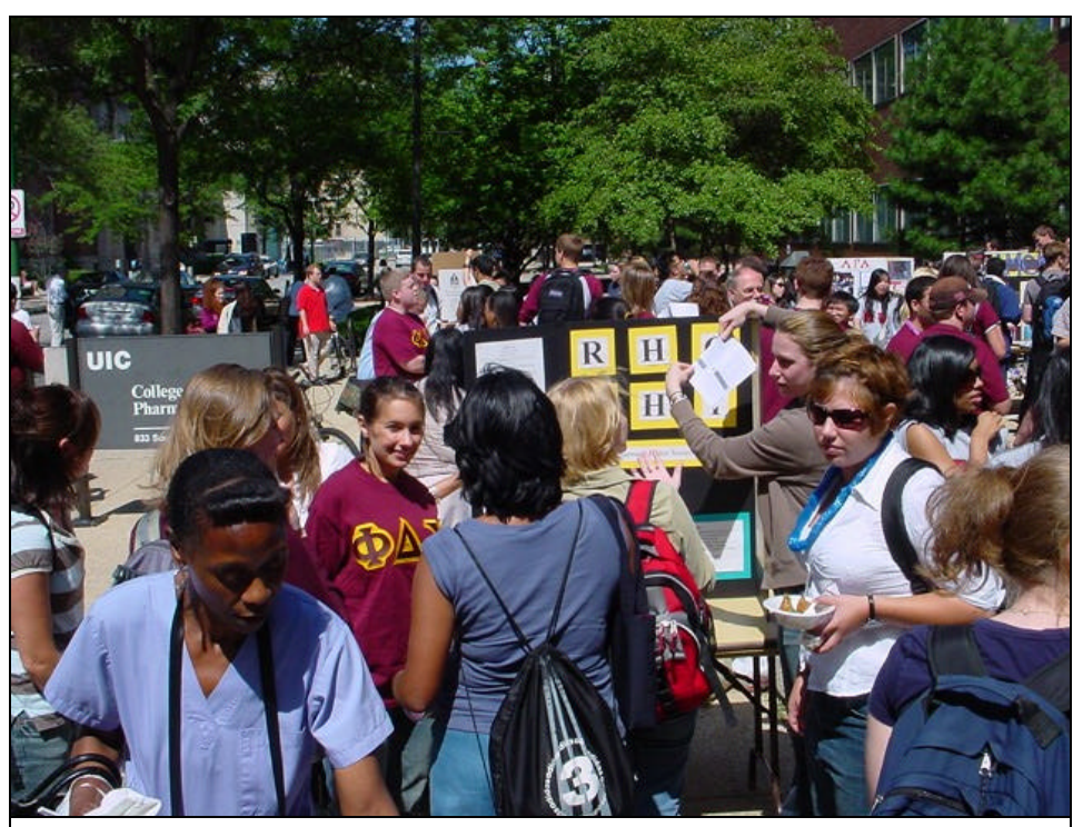
A busy Organization Day in which may College of Pharmacy Student were introduced to PDC.